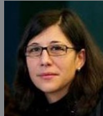
Sophie Kwasny Head of Data Protection Unit, Council of Europe, Strasbourg